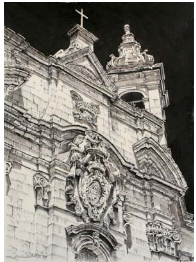
Our Lady of Liesz Church

Within the great city walls, the facades of Auberge de Castille and the relief of Gregorio Caraffa Bust at Auberge d’Italie , show the greatness and influence that the Knights had left when in Malta. The intricate baroque detail can